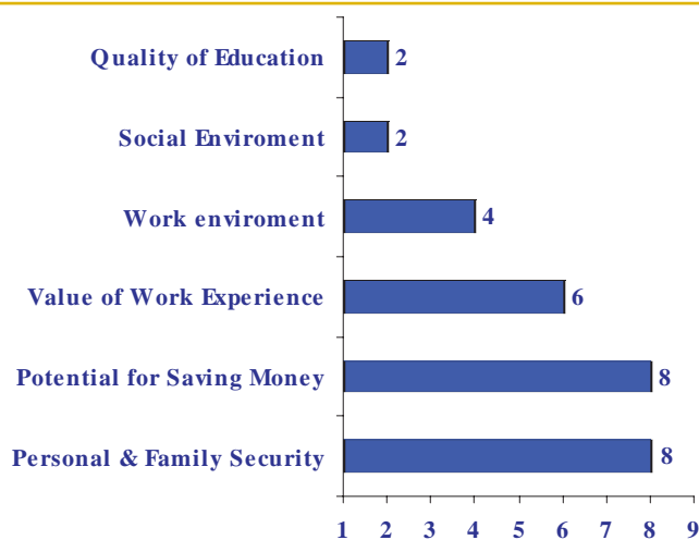
Rankings of Lebanon by Category